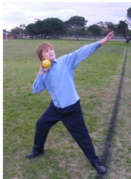
Mastering a shot putt technique at Currawong Children's Centre